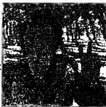
Red Army member Koza Okamoto flashes the victory sign in this 1985 file photo.